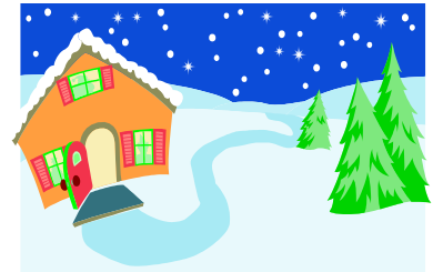
Home for the Holidays

Go to www.courtsofhighgate.com and check it out! You will need the Flash 7 Player to enjoy all the features of the site. Feel free to explore the site, and while you're there don't forget to sign up for the bulletin board. Once you register, we will call you via the phone number you have listed in the neighborhood directory to verify your registration. This is to ensure that only Courts of Highgate residents can access the bulletin board.