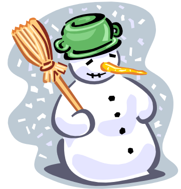
Let it Snow