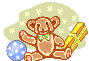
Toys for Tots