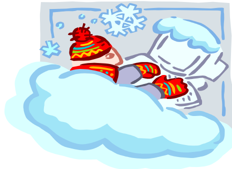
Check out the Web Site – it is real cool

We are pleased to announce that this year the schedule for lawn mowing is completely filled. We appreciate everyone who stepped up and volunteered.